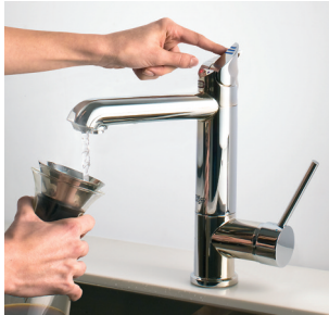
Instant boiling and chilled filtered water

Boiling and chilled filtered drinking water, instantly, PLUS hot, cold or mixed warm water – All from the one tap!