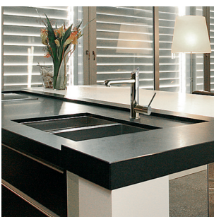
Simplifies kitchen design