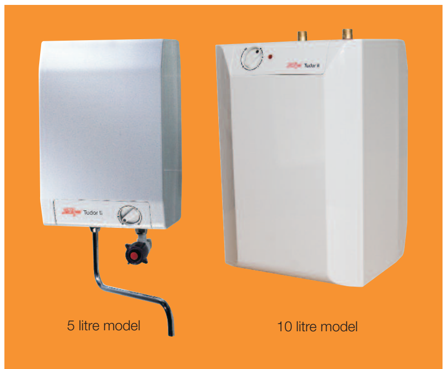
5 litre model

Open outlet to single point 5.0 litre, 10.0 litre